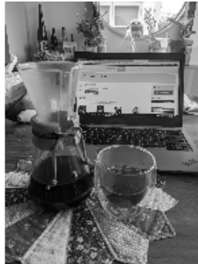
First coffee of the con.

Per tradition, I am working on a costume the day the convention starts