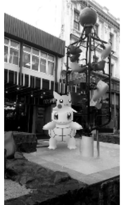
> First coffee of the con. @Dave Agnew Breakfast

I was going to run a #Pokemon raid tour of the CBD, but then COVID happened. Here is one of the Pokemon gyms we were going to visit.